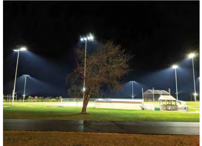
Newly lighted 90' baseball field at the Civic Center 2 Park

The project which began in 2016 and was completed in two phases included a magnitude of improvements. Such improvements included but were not limited to reconstruction and repairs to the tennis courts, repairs and painting of the basketball courts, expansion of two parking lots, repaving of the roadway and lots, regrading of the practice soccer fields, lighting of the new softball field, multi-purpose area, and 90' baseball field and the construction of a restroom facility and paved inter park trails.