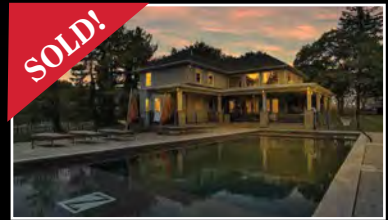
HUNTINGDON VALLEY, PA