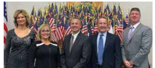
2022 Board of Supervisors

Monday, October 10th (Columbus Day), Thursday, November 24th (Thanksgiving Day), and November 25th (Day after Thanksgiving). The Administration Building will be closed starting Friday, December 23, 2022, through Monday, January 2, 2023, and reopen on Tuesday, January 3, 2023, February 20th, 2023 (President's Day)