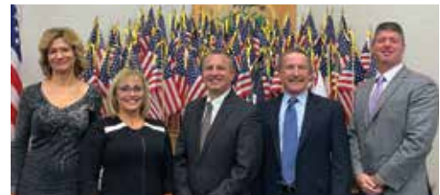
2024 Board of Supervisors

The Administration Building will be closed on the following dates: Thursday, July 4th & Friday July 5th (Independence Day) Monday, September 2nd (Labor Day)