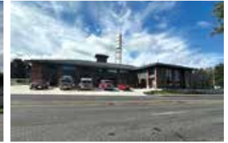
Richboro Station (#3)