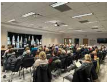
A Second Saturday program in March.

The Friends of the Free Library of Northampton Township sponsors the following library programs on the second Saturday of each month. Register for these popular programs because they fill up quickly.