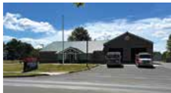
Churchville Fire Station (#83)

Tri-Hampton Rescue Squad is the sole designated Emergency Medical provider for Northampton Township and covers the other sections of the township as well from their Richboro Station (#115). In addition to fire response, all the full-time firefighters are Emergency Medical Technicians and support Tri-Hampton Rescue Squad township wide (in case you wondered why you see a fire truck on emergency medical calls).