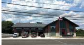
Holland Station (#73)

The new buildings provide components that the prior 55+ year old buildings were not designed to do, such as safety ventilation to protect our first responders, sleeping facilities (bunk rooms), women's facilities and ADA access just to name a few.