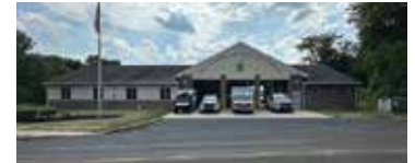
Tri-Hampton Rescue Squad

The Holland Station (#73) now has a dedicated paramedic unit operated by Tri-Hampton Rescue Squad. This is a significant improvement and guarantees a speedy response to critical medical emergencies in the Holland section of our community.