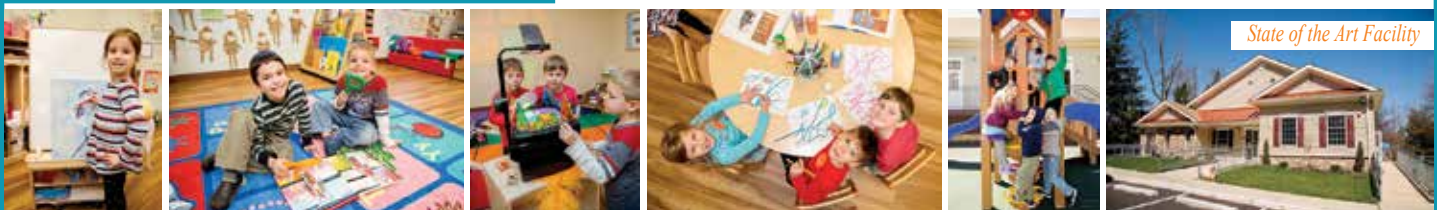
State of the Art Facility

All Locations are Keystone STAR 4 Centers Check our website and facebook for more information.