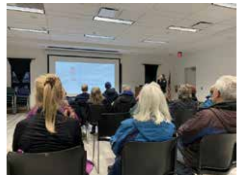
A PA Forward program on Scams & Fraud presented by Northampton Township Police in March.